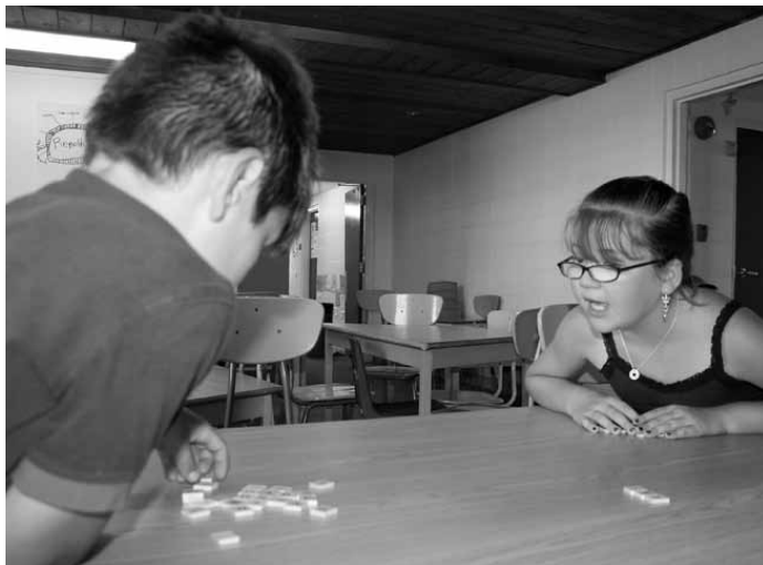
Reading University students practiced their literacy skills by playing various word games.

Thirty-five students between the ages of 7 and 10 years, all in grades 2 and 3, took part in the first-ever Reading University in July, with a goal of improving their reading and comprehension skills. The program was developed based on the belief that students who do not read at grade level by the end of grade three struggle to succeed in learning as they get older. The hope was that students, under the direction of eight enthusiastic young staff members, would have so much fun at Reading University that they'd forget they were also learning.